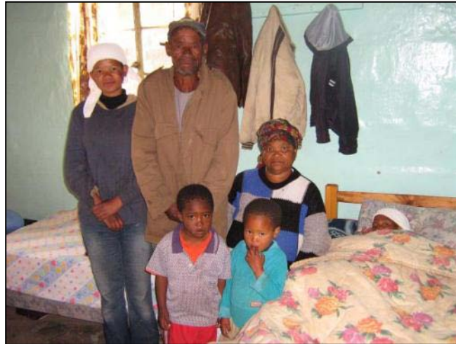
An HIV boy and his family members

Read more: http://www.avert.org/children.htm