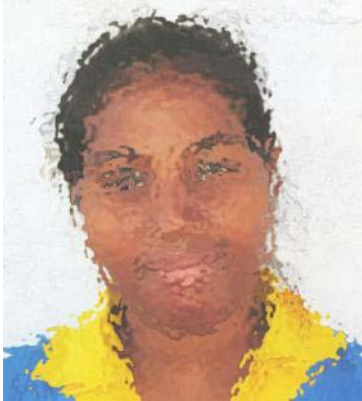
Maria (not her real name) – Aged 17 Kiribati

Last year I stayed with my older sister and her husband and their son. They were kind and I was happy with them. Sometimes my sister and her husband would leave us to stay in another village for a day or two. On their return my sister would be very abusive saying that I did not look after the boy well. One day my sister got angry and hit me and then told me that she never wanted to see me again and then she told me to leave the house. I went to another village and stayed with my uncle and his wife. I stayed with them for 3 weeks and then returned to my sister. On my return my sister apologized to me and I said, 'It's O.K. I have forgotten what happened already.'