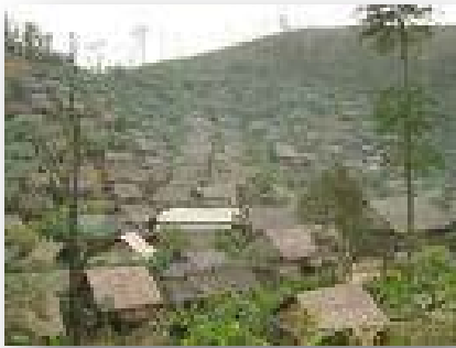
Mae La Refugee Camp, Thailand. The hospital is the building with the white roof in the middle.